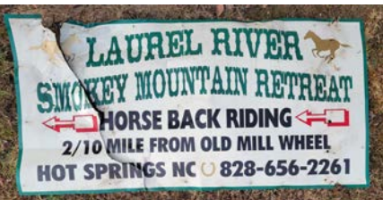
2002 Smokey Mountain Retreat Business Sign