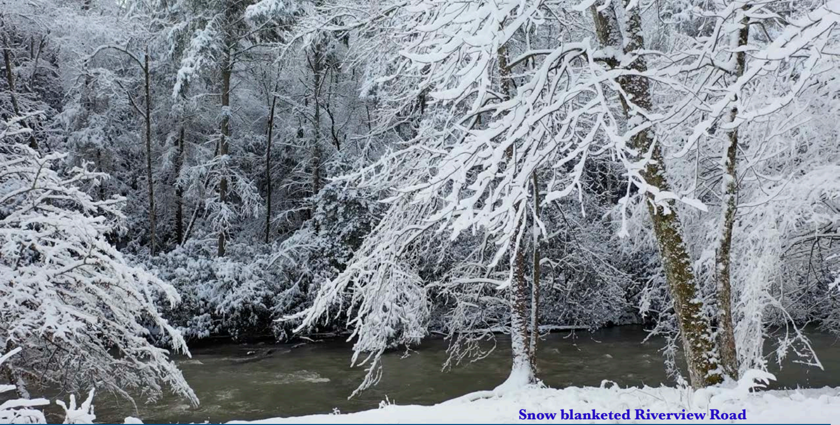
Snow blanketed Riverview Road