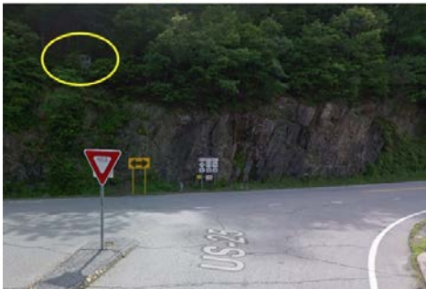
Now you see it, now you don't thanks to the lush foliage.