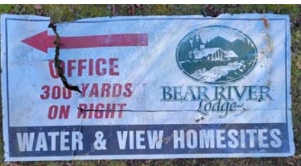
Circa 2004 BRL Homesites Office Directional Sign. Lower photo- 2005 BRL Sales Office Sign