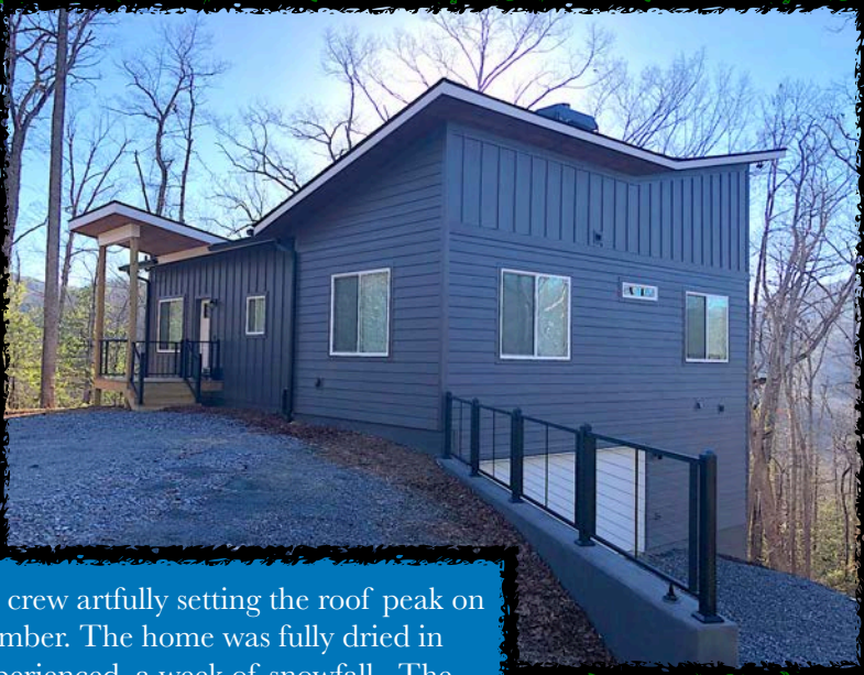
The BlueRidge Log Cabins crane crew artfully setting the roof peak on the Phillips new home in December. The home was fully dried in before our BRL community experienced a week of snowfall. The Irving home and the Phillips home are scheduled for completion in the first portion of 2025.